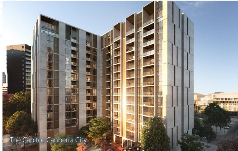
The Capitol, Canberra City