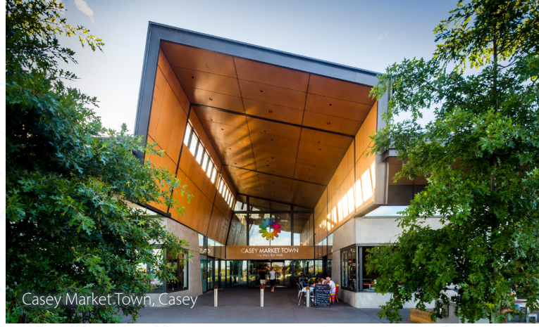
Casey Market Town, Casey